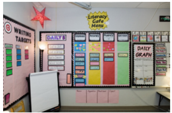
White board can be transformed into displays with some inexpensive borders and blue "tacky" adhesive.

Magnets stick easily to white boards making them a flexible and versatile space. When materials don't lend themselves to magnets as a way to adhere to the white board we love to use the blue "tacky" found in the paint section of many hardware stores.